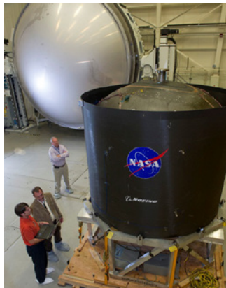
2.4 meter tank arrives at MSFC for inspection and testing