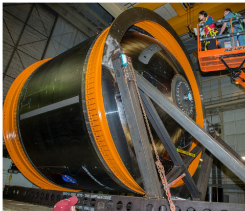
5.5 meter tank arrives at MSFC for inspection and testing