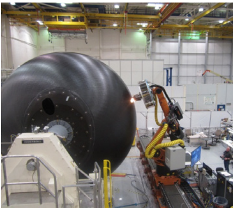
5.5 meter tank at Boeing's Development Center