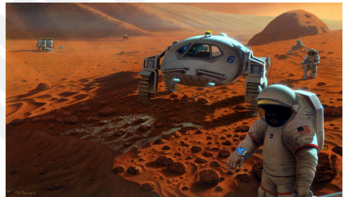
Astronauts who pioneer the solar system and Mars will use additive manufacturing to print 3-D supplies such as tools and equipment.

National Aeronautics and Space Administration