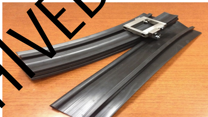
Linear seal closing mechanism.

National Aeronautics and Space Administration Langley Research Center Hampton, VA 23681