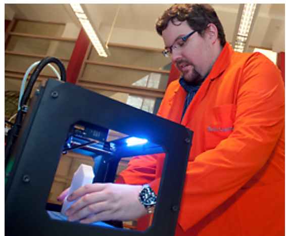
Student using the EBM process to build a part.

Glenn is including Case Western Reserve University (CWRU) students in real-world manufacturing projects with a local company. In addition, Glenn and CWRU will develop classes so that students can get hands-on experience with the processes and digital tools that industry uses in creating, manufacturing, maintaining, and disposing of products. Working on realistic, meaningful projects in space and technology will encourage the students to pursue careers in science, technology, engineering, and mathematics.