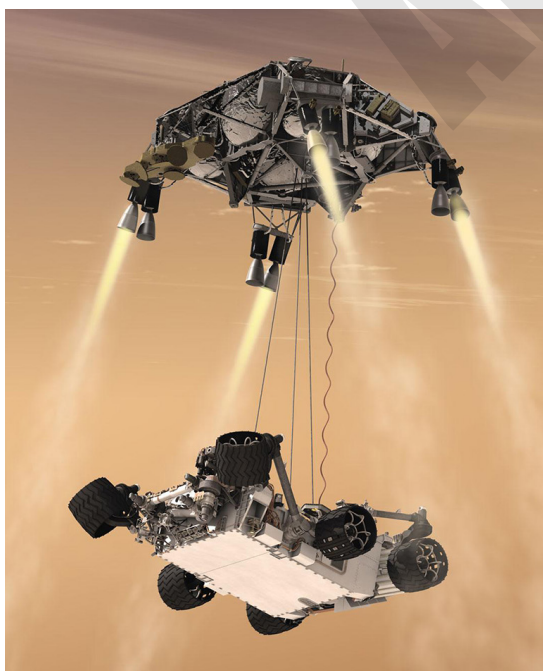
MSL with sky crane.

NASA's Space Technology Mission Directorate (STMD) has initiated the Propulsive Descent Technologies (PDT) project within the Game Changing Development (GCD) Program to advance the technologies associated with Mars propulsive descent. As a capability that maps into NASA's ultimate goal of bringing