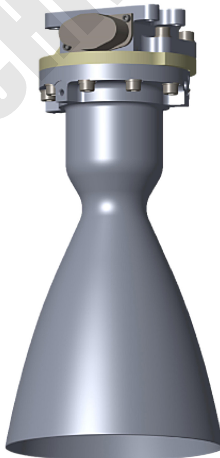
Development DSE planned for hot-fire test at Advanced Mobile Propulsion Test in 2017.

NASA's Marshall Space Flight Center evaluated available operational Missile Defense Agency heritage thrusters suitable for the science and lunar lander propulsion systems.