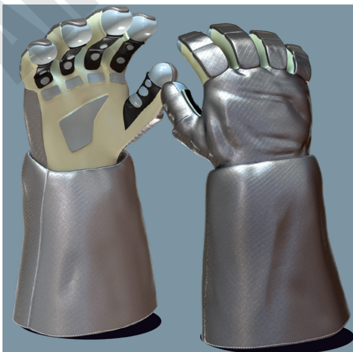
Prototype outer glove protective layer.

technological advances. A robotic assist glove will integrate a powered grasping system into the current EVA glove design to reduce astronaut hand fatigue and hand injuries. A mechanical counter pressure (MCP) glove will be developed to further explore the potential of MCP technology and assess its capability for countering the effects of vacuum or low pressure environments on the body by using compression fabrics or materials to apply the necessary pressure. A gas pressurized glove, incorporating new technologies, will be the most flight-like of the three prototypes. Advancements include the development and integration of aerogel insulation, damage sensing components, dust-repellant coatings, and dust tolerant bearings.