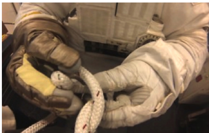
Knot tying dexterity test.

The Game Changing Development (GCD) Program investigates ideas and approaches that could solve significant technological problems and revolutionize future space endeavors. GCD projects develop technologies through component and subsystem testing on Earth to prepare